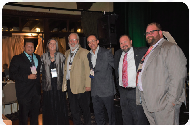
Pictured left: Patagonia Union High School salad bar recipient; right: Santa Cruz Center Salad bar recipient