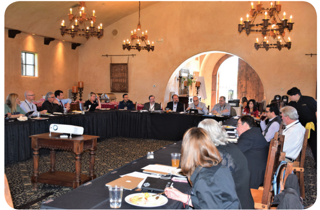
North America Produce Food Safety Working Group at the Spring Policy Summit