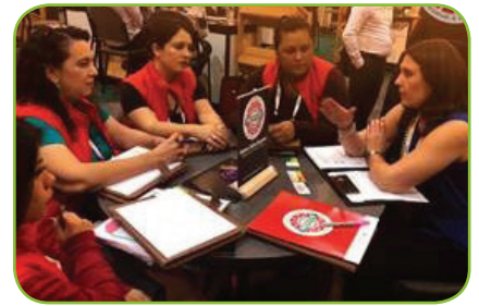
FPAAs meets with Mexico officials at the PMA Fresh Summit.

Fourth round of NAFTA renegotiations are held in Washington DC-FPAAs attends.