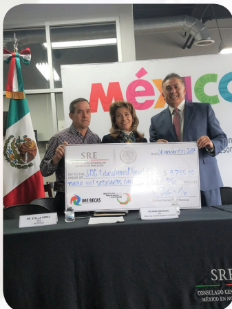
Pictured above: IME-Becas Scholarship presentations

The FPAA gives scholarships at the Sustainability Expo and staff assists with the IME-Becas Scholarships with Santa Cruz Community Center and the Consulate of Mexico.