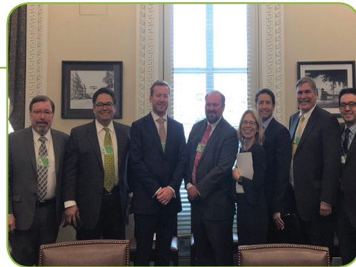
Left and Right: FPAA members on the Annual Trip to Washington, DC.